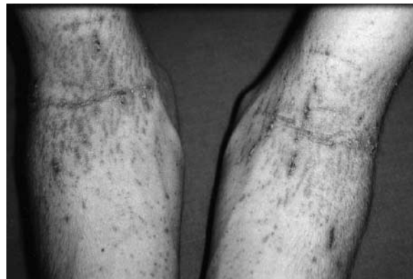
Fig. 1. Keratotic papules in a linear pattern at flexures of the upper extremities (patient 1).

Treatment with balneo-photo-therapy with 8-methoxy-psoralen and UVA irradiation (body: 57 treatments for 12 months with a total dose of 150.9 J/cm 2 ; feet: 36 treatments for 4 months with a total dose of 117 J/cm 2 ; knees and elbows: 25 treatments for 4 months with a total dose of 79.5 J/cm 2 ) did not improve the disease.