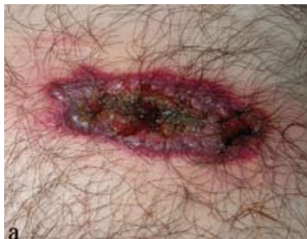
Fig. 1. (a) Purplish plaque on the abdominal wall, showing several bullae on the periphery and an adherent crust on the centre. (b) Erythematous infiltrated circinate lesions on the back.

Cutaneous lymphomas expressing a NK-cell phenotype represent a rare type of lymphoproliferative disorder.