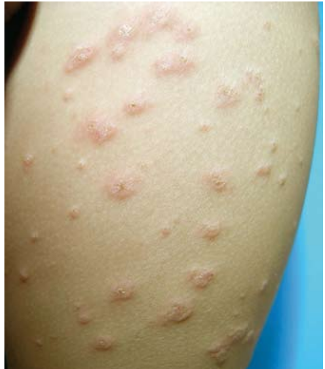
Fig. 1. Clinical aspect of the patient's eruption.

A previously healthy 3-year-old boy was referred to the Department of Dermatology for a pruritic cutaneous eruption that had developed 3 days after vaccination against hepatitis A (Havrix Vaccine ® , 0.5 ml/720 IU; GlaxoSmithKline Biologicals, Rixensart, Belgium) performed 4 weeks prior to his presentation. Eighteen to 24 months prior to admission the patient had been vaccinated against polio, diphtheria, tetanus, measles, mumps, rubella and Haemophilus influenzae B without any cutaneous complications. He had taken no medication and had no evidence or family history of atopy. On physical examination he appeared healthy, with normal growth and development. There was no fever, malaise or signs of infection from the respiratory and the genitourinary tract. The patient revealed a symmetrical eruption consisting of flesh-coloured firm 2–4 mm papules and papulovesicles on the extremities (Fig. 1), the buttocks and, to a lesser extent, on the trunk. Over the elbows, the buttocks and the knees, several lesions coalesced into plaques. There was a concomitant cervical, axillary and inguinal lymphadenopathy in the shape of small (< 1 cm), painless and mobile nodes. No target- or iris-like lesions, swelling, palmoplantar desquamation, erythema, conjunctival infection, mucosal or perianal involvement or hepatosplenomegaly were present. Routine blood tests including full blood count and biochemical profile were normal. Micro-