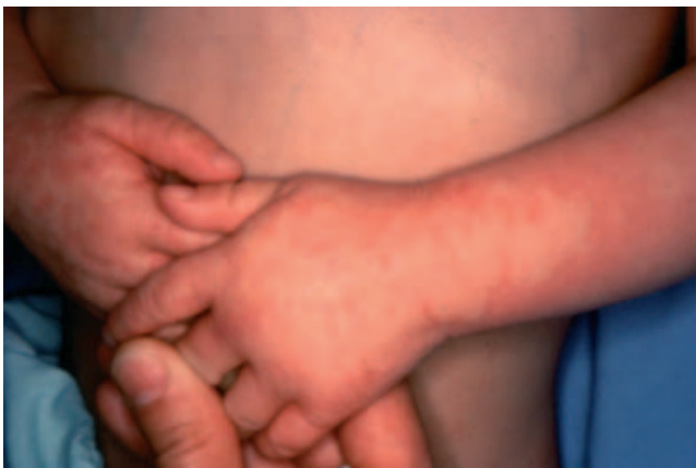
Fig. 3. Urticarial wheals on lichenified site of atopic dermatitis following fish challenge.

The effect of avoiding documented food allergens on the severity of AD is not fully known. Food allergy is clearly an aggravating factor in a subset of patients. In hospital paediatric practice it is rarely a causative factor, because elimination diets in isolation do not cure patients. Some eczema patients outgrow their food allergy yet still have eczema. The reverse is also seen, e.g. urticarial rashes