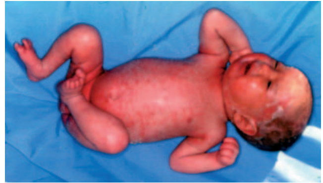
Fig. 2. Comel-Netherton syndrome presenting with exfoliative erythroderma and failure to thrive.

Experience suggests that treatment failure in AD is often associated with inadequate compliance and that poor communication regarding therapeutic objectives adversely affects the correct use of established treatments.