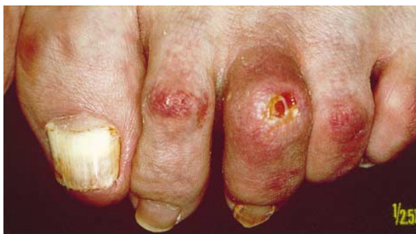
Fig. 1. Trichophyton soudanense onychomycosis of the great toenail. The nail plate is opaque and milky-white in colour.

The patients (1 male and 2 females, aged 65–69 years) were immunocompetent Caucasians affected by a toenail onychomycosis associated with tinea pedis due to T. soudanense . The affected nails showed a