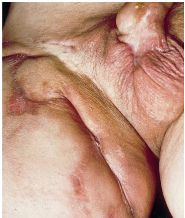
Fig. 2. Resolution of the disease with skin scarring after 2 months.