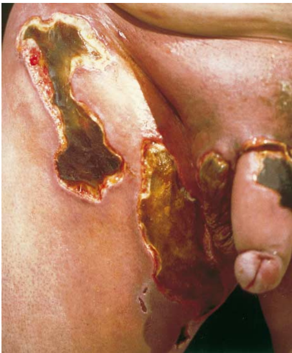
Fig. 1. Skin necrosis in the right groin, thigh and genitalia.

About 400 cases of Fournier's gangrene have been reported. It is more common in males (85%) than females. Its progression is rapid and it is lethal in 20–30% of cases. The condition is