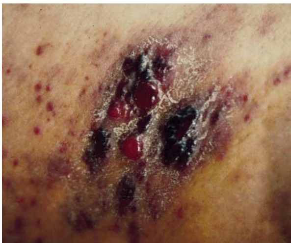
Fig. 1. Several nodules purple-bluish and firm angiomatoid, centrally confluent in a vast polypous plaque.

the patient died with peritoneal carcinosis and neoplastic wasting 6 months after diagnosis.