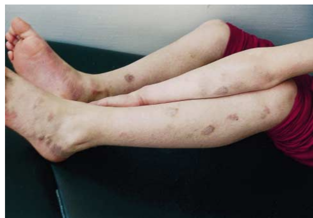
Fig. 2. Numerous brownish-red patches on the arms, legs and feet.

regions and 3–5 lymphadenomegaly, which were mobile and painless, were detected in both the axillary and the inguinal regions. Inguinal biopsy showed reactive lymph nodes. Other organ system examinations were evaluated as normal. There was no pathology in laboratory parameters (complete blood count, urinalysis, blood biochemistry, erythrocyte sedimentation rate, VDRL, TPHA or HIV). HHV-8 was found to be negative by PCR. Chest X-ray, abdominal ultrasound graphics and oesophageal, gastric, duodenal and colon contrast graphics were evaluated as normal. A skin biopsy specimen was taken from the lesion near the left ankle. There was widespread inflammatory mononuclear cell infiltration and prominent vascular proliferation in the medium and upper dermis. The histopathological picture corresponded with late macular stage of KS (Figs. 3 and 4).