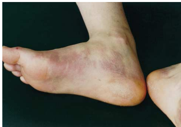
Fig. 1. Violaceous-red patches on the legs and feet.

Multiple lymphadenomegaly in the cervical and submandibular