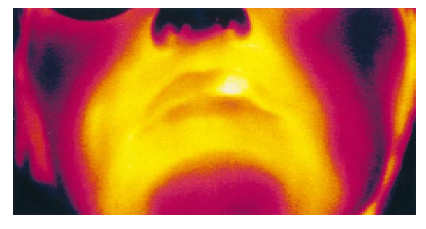
Fig. 1. Thermogram of subclinical prodromal herpes labialis. In this thermogram colour palette, increasing temperature is represented by lightening of colouration. Note localised increase in temperature over prodromal site, which disrupts the symmetrical pattern of facial features

On attendance during the prodromal phase all patients showed an increase in temperature with the mean localised change in temperature ( \Delta t^{\circ}C ) being 1.1^{\circ}C \pm 0.3^{\circ}C over a mean thermographically positive area of 126 \text{ mm}^2 \pm 34 \text{ mm}^2 (Fig. 1), as compared to the contralateral side. Of the 70 lesions all treated with acyclovir cream, 32 (46%) returned after 72 h of treatment with complete prevention of the developing lesion (Fig. 2), i.e. no clinical, thermographic or symptomatic evidence of RHL. Thirty-eight lesions (54%) progressed to produce a clinical manifestation of RHL. In 31 of these cases the \Delta t^{\circ}C mean measured at the symptomatic site was 0.6^{\circ}C \pm 0.2^{\circ}C .