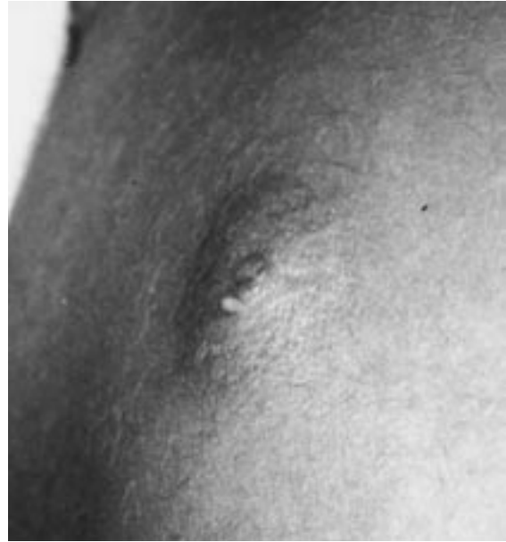
Fig. 2. Polyps on the breast of case 2.