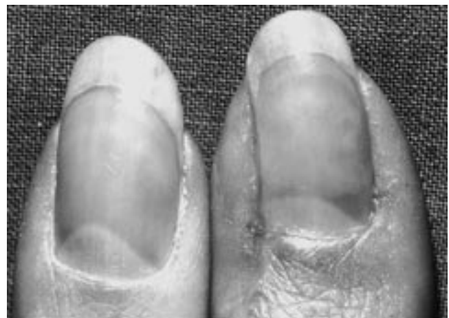
Fig. 2. Case 1, 6 months postoperatively, with acquired malalignment.