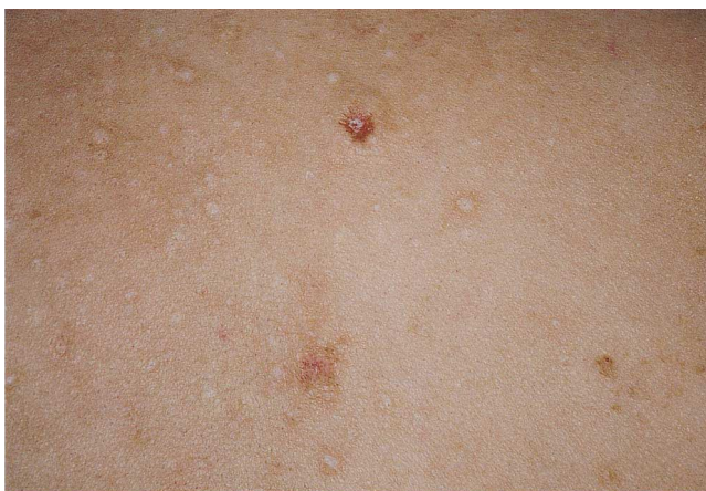
Fig. 1. Whitish papules and erythematous, scaly plaques on the back.

Multiple dermatofibromas associated with autoimmune disorders have been reported (1). Among these cases, systemic lupus erythematosus is the most frequently associated condition. In most cases immunosuppressive medications were given prior to onset, or increase in number or size of dermatofibromas. These reports are different in many aspects from the present case in that the lesions are usually found scattered on the limbs as well as the trunk, larger in size, and the surface is pigmented. In addition, the eruption does not involute with improvement of associated disorders.