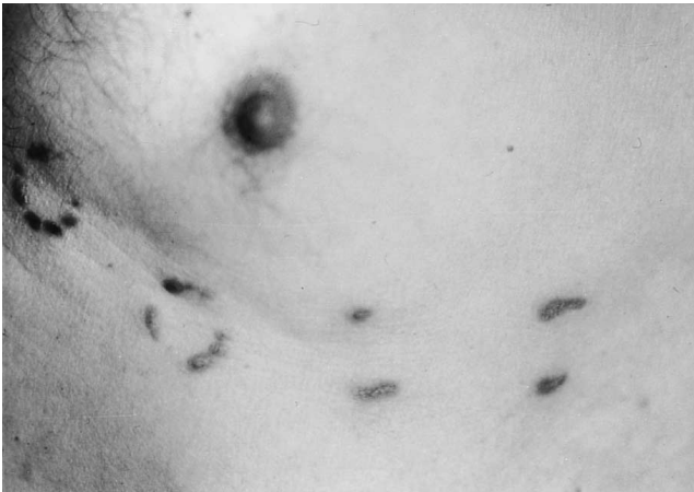
Fig. 1. Vesicular lesions, arranged in a ring-shape, at every site of application of the electrodes.

The allergic reactions that appear after ECG monitoring may be caused by ECG gels or pastes, alcohols found on