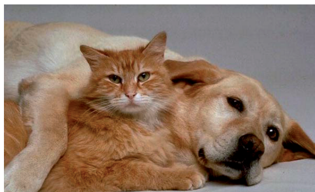
Fig. 1. Conflict of interest is a condition, not necessarily a behaviour. Dogs generally chase cats, but there are plenty of examples of them living together harmoniously.

Two important points emerge from this definition. The first is that COI is a condition and not necessarily a behaviour. It may be said for instance, that dogs generally chase cats, yet there are plenty of examples of the two living together in harmony (Fig. 1). Merely being a dog does not necessarily mean that a type of behaviour (chasing cats) has occurred – it simply means that on average a dog will chase ( behaviour ) a cat because of the condition of "being a dog". In other words, COI is a set of circumstances, interests or conditions that place the affected person in a position of potentially being influenced by those circumstances. It does not