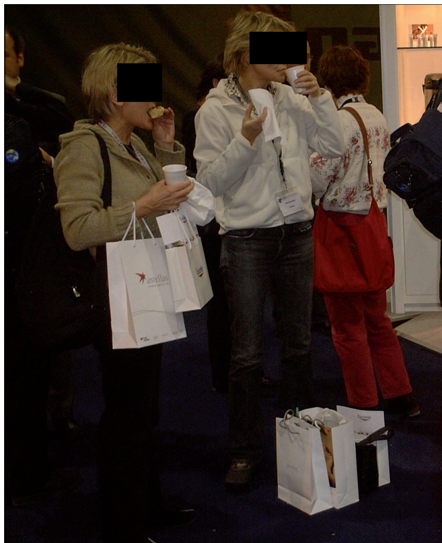
Fig. 3. Is this the new face of modern dermatology?

I wish to emphasize that the aim of these commentaries is not to discourage a flourishing and innovative healthcare industry, but to ensure that processes are in place in proportion to need that ensure that COI are addressed fairly and openly. It is time for the taboo of COI in dermatology to be broken and for all concerned with its effects – including the public – to begin open discussions. That time is now – or else we risk losing the very foundation of values on which the dermatology profession is built (Fig. 3).