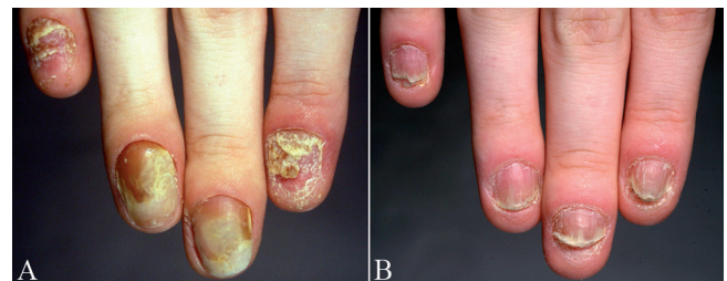
Fig. 2. (A) Finger nails showing brown discolouration, swelling and dystrophy. Periungual erythema. (B) Normal appearance of the distal nail plate after 6 months of caspofungin treatment.