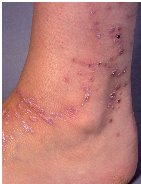
Fig. 1. Multiple livid lichenified papules, linear scarring, crusts and milia on the dorsal side of the patient's feet, ankles and distal lower extremities.

A biopsy from a lichenoid papule showed orthohyperkeratosis, acanthosis and multiple subepidermal splits and no typical criteria for lichen planus. Bullous autoimmune dermatoses, such as epidermolysis bullosa acquisita and pemphigoid were excluded by negative direct and indirect immunofluorescence. Immunohistochemical staining with antibodies against type IV collagen labelled the blister roof. This finding corresponds to blister formation below the lamina densa. Electron microscopy (EM) revealed areas of few or even absent anchoring fibrils (Fig. 2a and b). Confocal laser microscopy supported the diagnosis by verifying the absence or reduction of collagen VII, a main