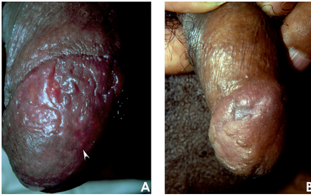
Fig. 1. (a) Case 1: multiple scabbed papules (arrow); proximally, presence of ulcers and scars. (b) Case 2: after treatment, showing typical irregular depressed scars.

The occurrence of penile tuberculids is a very rare but well-documented event (3, 5, 7–9). Most reports come from Japanese and South African authors (3, 5, 7, 13), suggesting a racial or environmental predisposition, but occasional patients have been seen in other countries (8, 9). To our knowledge, South American patients have not been reported so far.