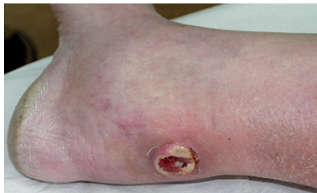
Fig. 2. Two-week-old infiltrate on the heel.

On referral to our clinic on 26 February 2004, 3 new lesions had developed within the last week. A biopsy was taken from a lesion on the thigh. This showed an intense inflammatory process with panniculitis and a congregation of Actinomyces -like bacterial structures in the infiltrate (Fig. 3).