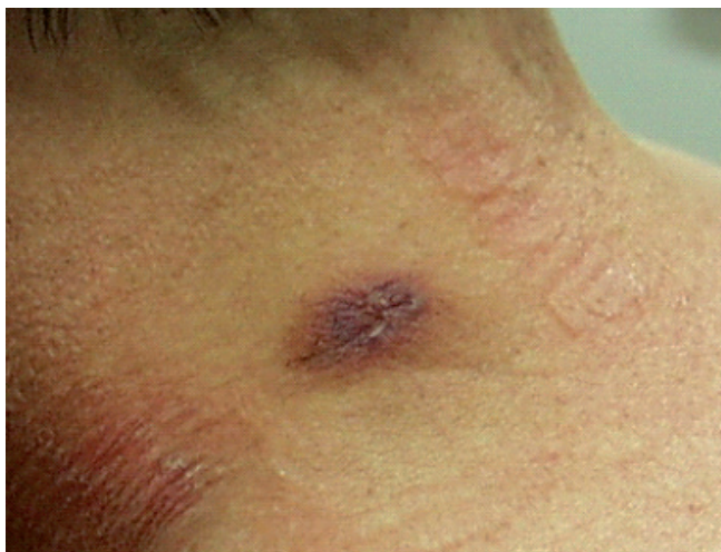
Fig. 1. New infiltrate on the back of the neck.

The patient received treatment with clindamycin for 4 weeks with no effect. X-ray of the lungs and heart was normal. A skeletal scintigram showed no abnormalities. Bacterial swabs from ulcers were repeatedly negative. The sedimentation rate was 40 mm/h.