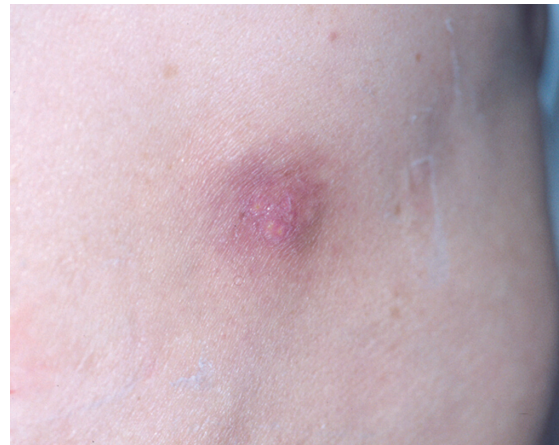
Fig. 1. Inflammatory nodule at the sites of subcutaneous leuprorelin depot injections on the lateral aspect of the left buttock.

During the following months, the patient developed two additional similar lesions on the left buttock (Fig. 1) and on