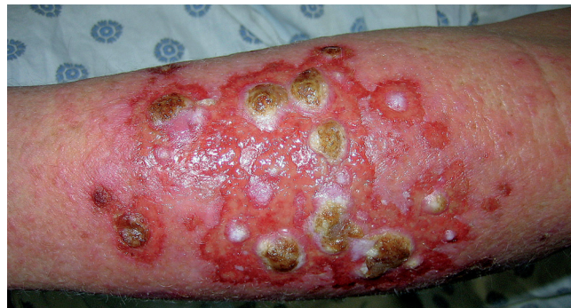
Fig. 1. Patient's left forearm revealing an extensively eroded markedly indurated plaque on an erythematous base containing more than 17 foci of well-delineated crusted inspissated exudative discoid nodules, dome-shaped and hyperkeratotic, up to 1–1.5 cm in size.

On histopathological examination the first biopsy revealed absence of the typical crateriform morphology usually associated with solitary SCC-KA, but a nodular proliferation of cytologically malignant keratinocytes was seen invading the