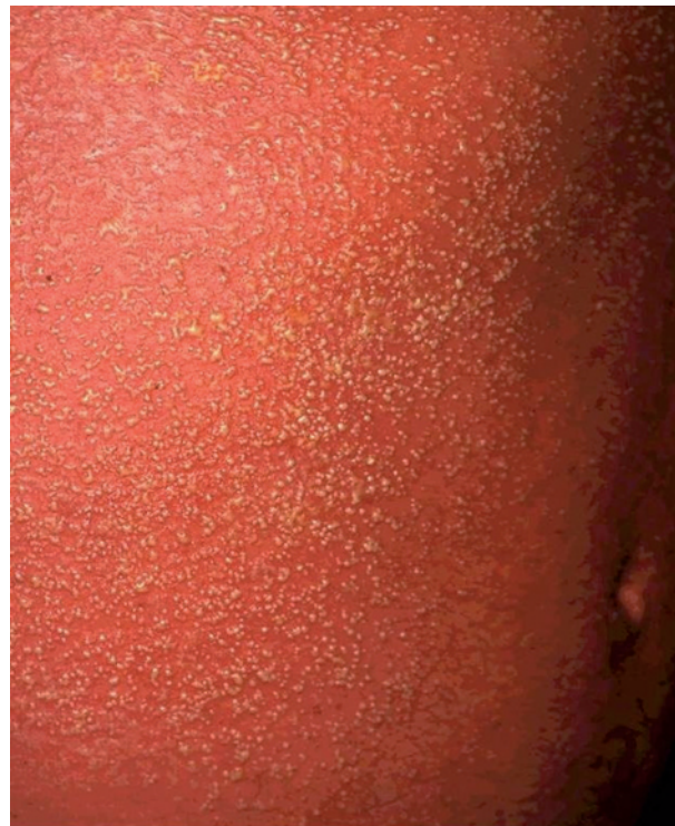
Fig. 1. Erythematous rash covered with non-follicular pustules.

A cutaneous biopsy showed subcorneal non-follicular pustules, epidermal spongiosis, focal keratinocytic necrosis and basal vacuolar degeneration. Papillary dermal oedema and diffuse perivascular infiltrates of