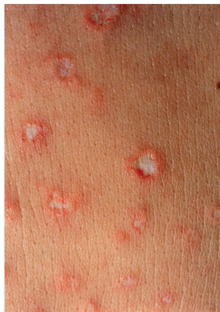
Fig. 1. Typical skin lesion of Degos' disease with an umbilicated atrophic porcelain-white centre and a rim of erythema.

A 31-year-old man presented with a 6-month history of an asymptomatic rash on the limbs and trunk (Fig. 1). It consisted of multiple atrophic porcelain-white scars surrounded by a slightly raised erythematous telangiectatic rim (Fig. 2). He was otherwise systemically well and in good health. He had no significant medical or family history and was not taking any medications. Physical examination was otherwise without pathological findings and the mucous membranes were not involved. Thorough neurological examination was