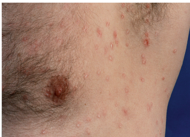
Fig. 2. Typical skin lesions occurring all over the body.