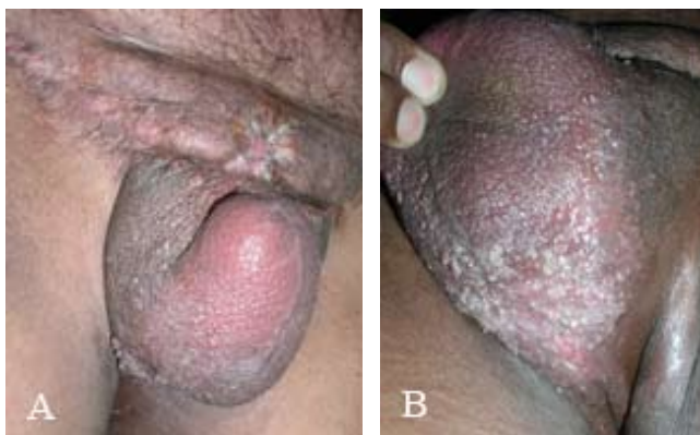
Fig. 1. Total penectomy with scar of ileoinguinal lymphadenectomy and lymphangiectasias on the base and lateral aspect of the scrotum (right side) (A). Close-up of skin with coloured-to-whitish lesions of lymphangiectasias (left side) (B).

Lymphangiectasias are sustained dilatations of otherwise normal surface lymphatic channels (1). They are not neoplasms or true hamartomas like lymphangiomas. Lymphangiectasias occur due to fibrosis of the surrounding connective tissue, which causes back-pressure and dermal back-flow (1). Lymphangiectasias are reported on vulva and upper thighs in women after major surgery for breast cancer and cervical cancer (2, 5). There are also scattered reports of scrotal lymphangiectasias. Lymphangiectasias have been known to occur after recurrent infections, radiotherapy, scrofuloderma and repeated trauma (1, 6, 7). Cutaneous lymphangiectasias can mimic warts, condyloma acuminata and molluscum contagiosum as they did in this case (1, 3). They can also become a portal of entry for infections. The lymph oozing from these lesions can be mistaken for incontinence, as occurred in this case. Also the perineal