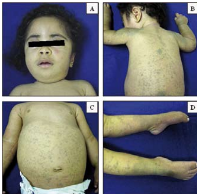
Fig. 1. (A) Typical dysmorphic features, including coarse facies and flattened nasal bridge. (B) Extensive, blue cutaneous patches of the posterior trunk. (C) Similar skin changes present over the anterior trunk. (D) Legs and feet showing marked variation in size and shape of macules.

Definite diagnosis of GM1-gangliosidosis was made on typical urinary oligosaccharides chromatographic profile and low level of \beta -galactosidase activity in leukocytes and cultured skin fibroblasts. Normal urinary excretion and chromatography of glycosaminoglycan and level of \alpha iduronidase could rule out mucopolysaccharidosis (MPS) type I.