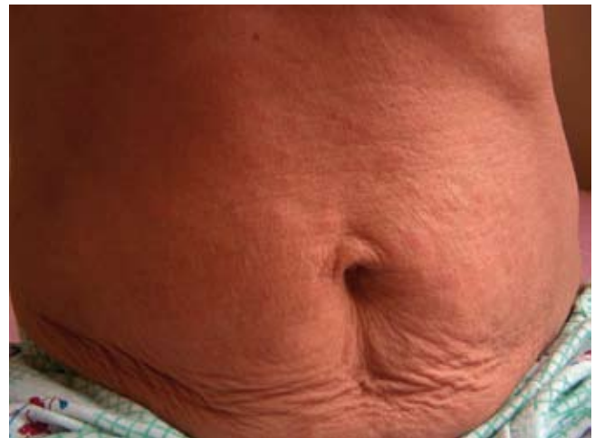
Fig. 1. Abdomen of the patient showing widespread erythema after imatinib treatment.

Imatinib functions by competitively inhibiting the adenosine triphosphate-binding site of the protein kinase enzyme, leading to the inhibition of tyrosine phosphorylation of proteins involved in BCR-ABL gene without