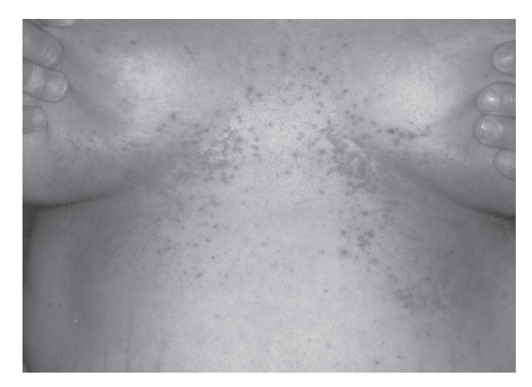
Fig. 1. Darier's disease. Inflamed, confluent dyskeratotic papules on the chest and under the mammae.

A 46-year-old woman was diagnosed with DD at the age of 18 years. She has had warty keratin-capped brown papules mostly in the forehead and middle chest (Fig. 1). Longitudinal streaks and distal notches were observed on the nails. Family history was negative for DD. CVG had also been present on the middle forehead and on the occipital region of the scalp since childhood (Fig. 2).