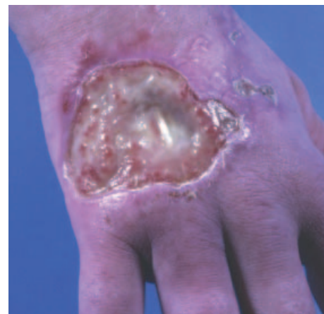
Fig. 3. A 45-year-old woman presented with one large and several small ulcers on the right forearm and right lower arm, denying any chemical or physical damage to the skin. Occlusive dressing led to a quick recovery.