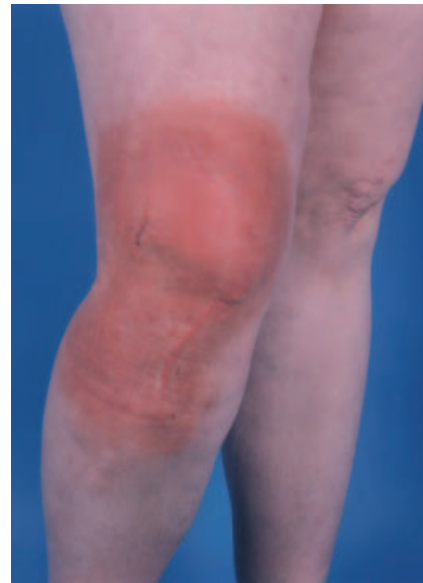
Fig. 2. A 42-year-old woman presented the skin changes shown here. She could not give any explanation as to the cause. Occlusive dressings led to a quick recovery.

Approximately 18% admitted or were judged to have an abuse of alcohol, medicaments or cannabis. A total