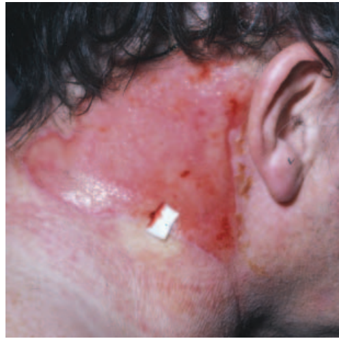
Fig. 6. This 52-year-old man was followed for almost 2 years in our department. He complained of 'erosions', which would suddenly develop in his head and neck region. The clinical picture varied from almost healed lesions to sudden involvement of acute erosions affecting most of his head with sharp demarcations. He accepted that he was likely involved in the occurrence of the skin lesions as he felt he had to remove 'disease' from his head. Despite extensive dressings he continued to develop new erosions.