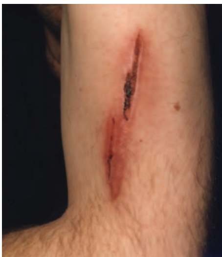
Fig. 1. A 37-year-old man who presented with two lesions on his left upper arm. He denied any trauma, but could not explain why the lesions developed. He had no other skin symptoms. Occlusive dressings led to a quick recovery.

Among 30 patients who were confronted with ‘self-infliction’ as the cause for their symptoms, one-third admitted that self-infliction was part of the cause, but two-thirds either denied this or stopped coming for further control. Only one woman agreed to meet a psychiatrist.