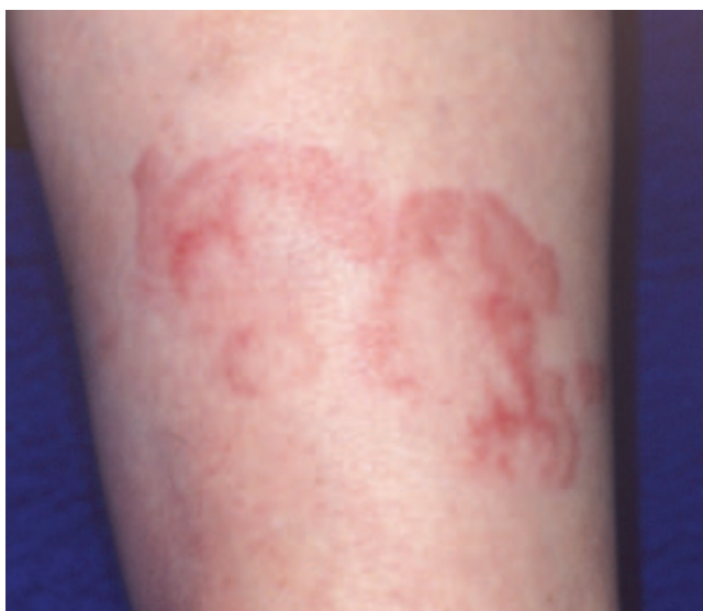
Fig. 1. Urticarial erythematous plaques located on the thigh, showing an annular arrangement in some areas.

A 53-year-old Japanese woman presented with a 3-year history of intensely pruritic eruptions without any other systemic symptoms. Various antihistamines had been tried without apparent benefit. She had no history of allergic diseases such as asthma or allergic rhinitis. Physical examination revealed pruritic, urticarial erythematous plaques predominantly located on the extremities with frequent recurrence. The lesions were partly fused and produced an annular arrangement in some parts (Fig. 1). Each lesion lasted for about 10 days and gradually disappeared resulting in brown pigmentation. All the laboratory data were normal including peripheral blood eosinophil counts, erythrocyte sedimentation rate, C-reactive protein, immunoglobulins A, M, G and E, complement levels and tumour markers. Antinuclear antibody, rheumatoid factor, and antibodies for hepatitis B and C viruses were negative. Systemic