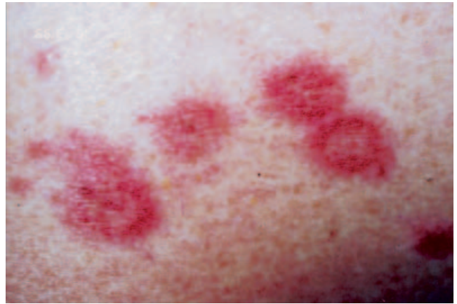
Fig. 1. Multiple, slightly scaling, erythematous, annular plaques in a photosensitive distribution on the trunk, the extremities, face and neck of case 1.

Case 2. A 63-year-old woman presented with a skin eruption, which had developed 2 months earlier. For 6 years she used