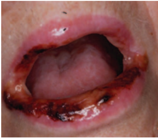
Fig. 1. Oral erosions at time of diagnosis.