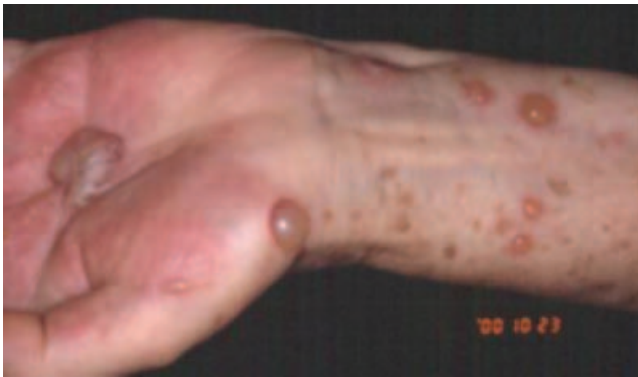
Fig. 2. Tense blisters on palms and forearms.

testing with serum and fluid blister using monkey oesophagus demonstrated circulating IgG antibodies that bound uniformly throughout the squamous epithelium (in a cytoplasmic pattern) interfering with cell surface antibody reactions. IIF with human salt-split skin demonstrated IgG binding to the whole epidermis (cytoplasmic pattern) and the basement membrane zone (Fig. 3). IIF on rat bladder epithelium was also positive (Fig. 4). Immunoprecipitation studies (performed in