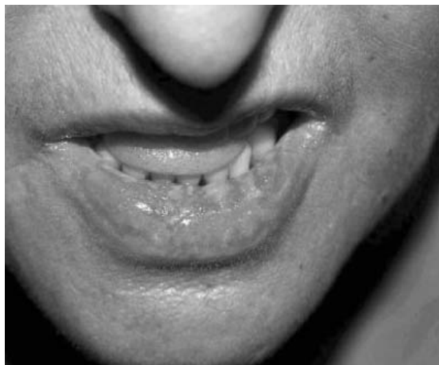
Fig. 1. Ulcers on the inside of the lip.

The definition of overlap syndromes is somewhat controversial in the medical literature. Most authors use this term for the coexistence of two distinct clinical entities. Some of them are relatively common, (RA-SLE, RA-Sjögren syndrome, RA-polymyositis, SLE-polymyositis), while others are relatively rare. The overlap between SSc and RA is less common, and represents a distinct clinical