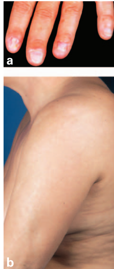
Fig. 1. (a) Left hand: Note longitudinal ridging of the nails of the index and ring finger. The proximal nail folds are deformed, and that of the ring finger is hyperplastic. (b) Left shoulder and upper arm showing a linear hypopigmentation.

Moreover, the probanda reported that her mother had streaky hypopigmented lesions and that a severely malformed eye was removed shortly after birth. The