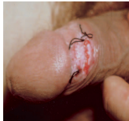
Fig. 2. Coalescing erosions with vegetating borders of the glans and the mucous surface of the prepuce.