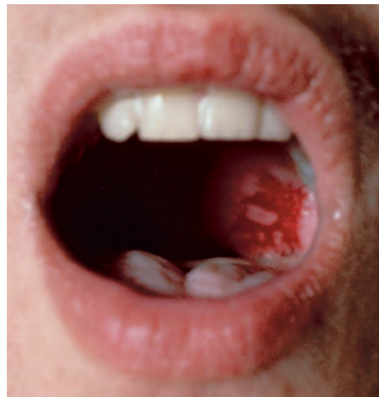
Fig. 1. Erosions of the cheek mucosa with central hypertrophic and vegetating epithelium regeneration.

Unfortunately, the patient did not comply with the instructions; once he discontinued corticosteroids, the disease relapsed with cutaneous bullae typical of pemphigus vulgaris. Within the first year he was lost to follow-up and we could not observe the long-term evolution of this case.