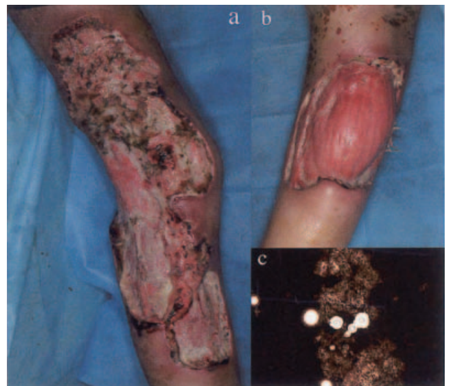
Fig. 1. Large, deep ulcers on the left (a) and right (b) legs. Cryptococci were found in the smear of pus by the India ink technique (c).

Our histological study of the four serial biopsy specimens demonstrated the dynamic changes in the