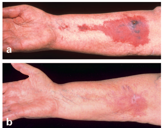
Fig. 1. (a) Volar aspect of the forearm, showing a plaque of indurated erythematous skin with central necrosis. (b) Same patient after 4 months.

Benign reactive vascular proliferations of unknown aetiology include RAE, acroangiokeratosis and diffuse dermal angiomatosis. The clinical features of RAE range from ecchymoses, macules and plaques to bullous lesions (1, 2). Different conditions have been associated with generalized forms of the disease, although it remains unknown to what extent any of these are truly causative, with a marked inter-case heterogeneity in clinical pattern, disease course and histopathological features (2). RAE is not related to intravascular lymphoma (angiotropic lymphoma or intravascular