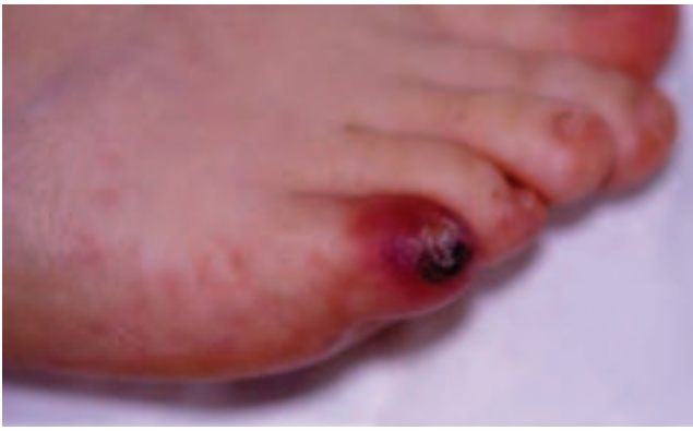
Fig. 1. Necrotic cutaneous lesions and livedo of the fifth toe of the right foot.