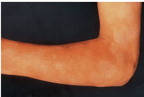
Fig. 1. Hypopigmented scaly patches on the external aspect of an upper limb, mimicking extensive pityriasis alba in a boy (patient no. 2) with pigmented skin.

sun exposure in 2 patients, topical nitrogen mustard in 3 patients and excision in 1 patient. Each modality was given either as the initial therapy or after failure with another therapy, i.e. after partial or no response, or during relapse (Table I). A final complete response was achieved in all patients except in patient no. 10, who is still receiving therapy with narrow-band UVB 3 times