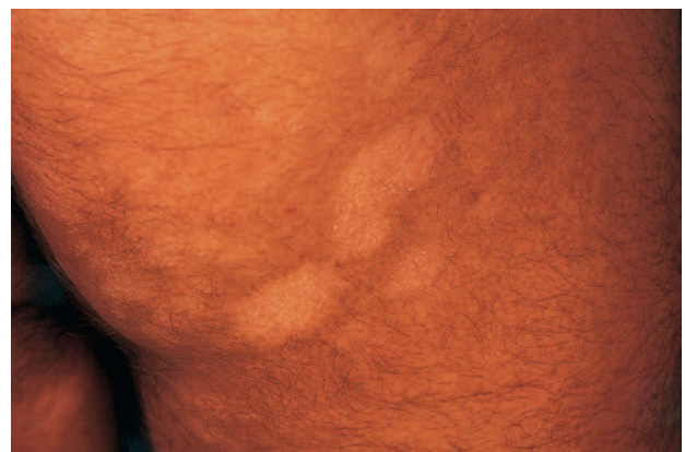
Fig. 3. Hypopigmented scaly patches on the buttocks of a boy (patient no. 10) with pigmented skin.