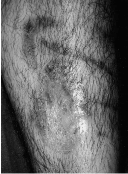
Fig. 3. The lesion after a mechanical trauma as a result of a car accident. The erythematous and elevated border can be observed in the upper and lower regions.

elastica. Similar lesions of AG and AEGCG include atypical necrobiosis lipidica of the face and scalp (4), Miescher's granuloma of the face (5) and granuloma multiforme (6).