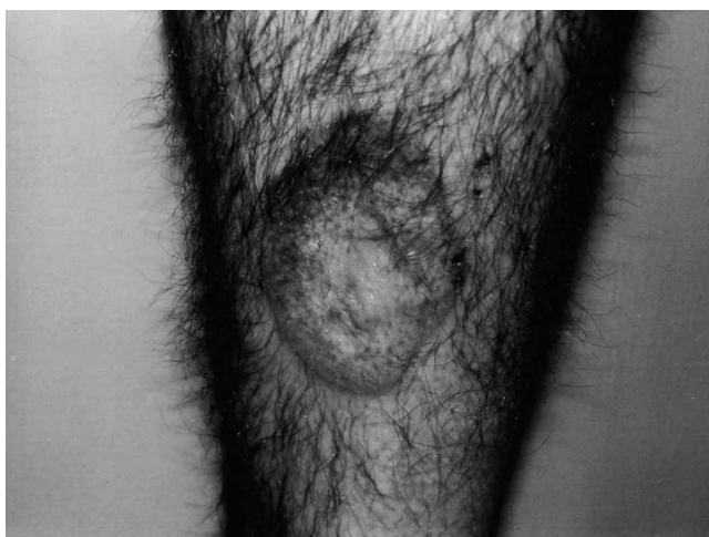
Fig. 1. Clinical aspect of the lesion. Subjacent vascularization could be observed through the atrophic, hypopigmented, hairy-free centre.

Actinic granuloma (AG) was first described by O'Brien in 1975 (1) and confirmed by Toribio et al. in 1978 (2) as asymptomatic annular lesions similar to those of granuloma annulare that spread on sun- or heat-damaged skin. It is characterized histopathologically by giant cell elastophagocytosis in the active border, loss of elastic fibres in the inner and a prominent actinic elastosis surrounding the annular plaque. The term 'actinic' indicates its external or environmental origin, embracing every form of electromagnetic radiation such as ultraviolet, visible light, infrared and X-ray (1). In 1979, Hanke et al. (3) described a similar picture in non-sun-damaged skin as annular patches with erythematous borders and hypopigmented centre but without solar elastosis, namely AEGCG. The authors rejected its actinic origin as they did not find actinic damage at the site of the lesions and it remains as an entity with unknown aetiology. Main histological changes taking place in AEGCG include the presence of giant cells, granulomatous inflammation and loss of