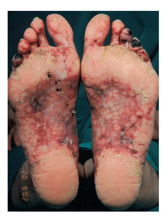
Fig. 2. Livedo and ulceronecrotic lesions surrounded by cyanotic skin on the toes and soles.

(dsDNA), as measured by Farr's method, anti-histone antibodies by immunoblotting, anti-thyroglobulin, antithyroid microsomal, anti-mitochondrial and antismooth muscle antibodies by IIF and rheumatoid factor. Normal tests were also obtained for the presence of lupus anticoagulant (LAC), detected using various coagulation tests, such as kaolin clotting time, silica clotting time and diluted Russel viper venom time, anticardiolipin antibodies (aCL) and anti-beta2glycoprotein 1 (beta2-GP1) antibodies, measured by ELISA, antineutrophil cytoplasmic antibodies (ANCA), circulating immune complexes and cryoglobulins. A thyroid function test was within the normal range and serologies for hepatitis B and C, coxsackiae B, parvovirus and ECHO viruses were negative, while serologies for EBV and CMV were suggestive of previous infection. Also normal were the coagulation tests, including serum fibrinogen, fibrin and degradation products, thrombin time, activated partial thromboplastin time; the results for factor V Leiden and prothrombin 20210 mutation analysis were negative and factor VIII level was normal as were the functional levels of antithrombin III, protein C and protein S.