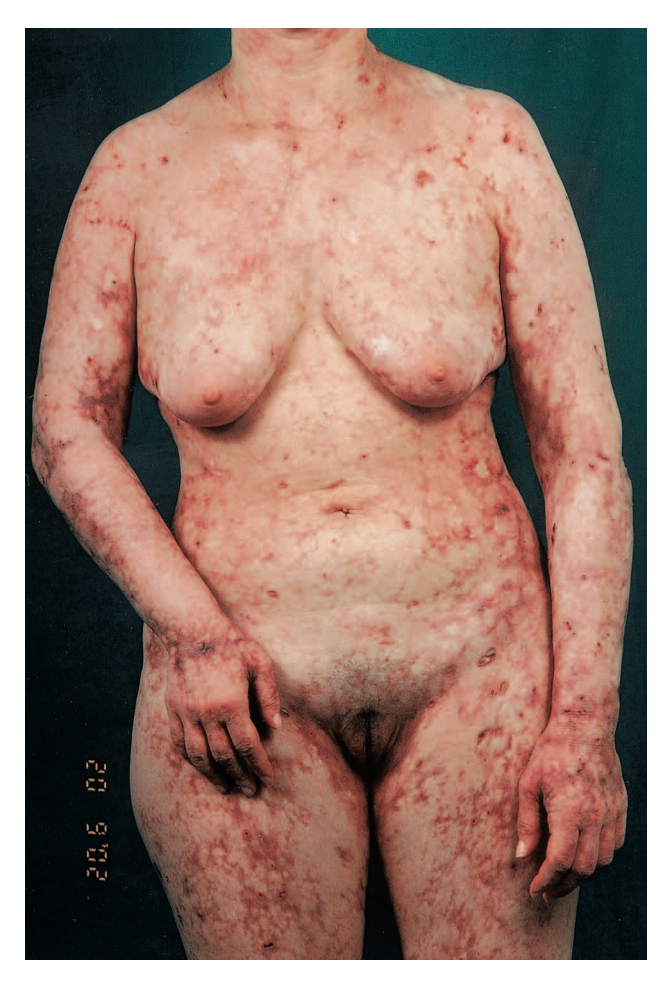
Fig. 1. Widespread livedo reticularis and multiple skin ulcers over all four limbs and trunk.

(dsDNA), as measured by Farr's method, anti-histone antibodies by immunoblotting, anti-thyroglobulin, antithyroid microsomal, anti-mitochondrial and antismooth muscle antibodies by IIF and rheumatoid factor. Normal tests were also obtained for the presence of lupus anticoagulant (LAC), detected using various coagulation tests, such as kaolin clotting time, silica clotting time and diluted Russel viper venom time, anticardiolipin antibodies (aCL) and anti-beta2glycoprotein 1 (beta2-GP1) antibodies, measured by ELISA, antineutrophil cytoplasmic antibodies (ANCA), circulating immune complexes and cryoglobulins. A thyroid function test was within the normal range and serologies for hepatitis B and C, coxsackiae B, parvovirus and ECHO viruses were negative, while serologies for EBV and CMV were suggestive of previous infection. Also normal were the coagulation tests, including serum fibrinogen, fibrin and degradation products, thrombin time, activated partial thromboplastin time; the results for factor V Leiden and prothrombin 20210 mutation analysis were negative and factor VIII level was normal as were the functional levels of antithrombin III, protein C and protein S.