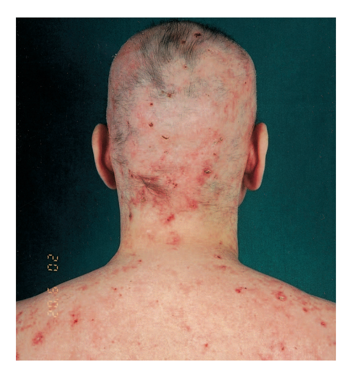
Fig. 3. Non-scarring alopecia involving almost all scalp.

Radiography of the chest, sonographic examination of the abdomen and echocardiography as well as ophthalmologic investigation revealed no abnormalities.