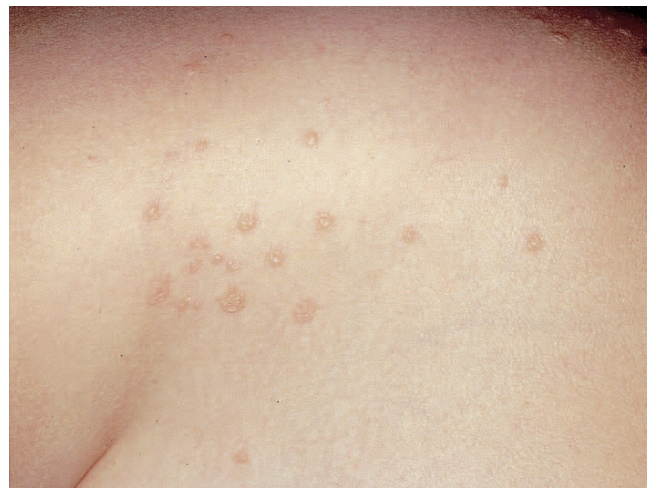
Fig. 1. Flaccid vesicles and pustules up to 1 cm in diameter on normal skin of the trunk.

Histological examination of an early lesion (Fig. 2) showed a subcorneal blister containing neutrophils and scanty mononuclear cells. The underlying epidermis exhibited minimal spongiosis with a few migrating leucocytes. The dermis contained a perivascular infiltrate comprising neutrophils, occasional eosinophils and mononuclear cells. Direct immunofluorescence failed to show any immunoglobulin deposition. Bacteriological, mycological and virological cultures of pus remained negative. Serum protein electrophoresis was in the normal range and serum immunoblotting did