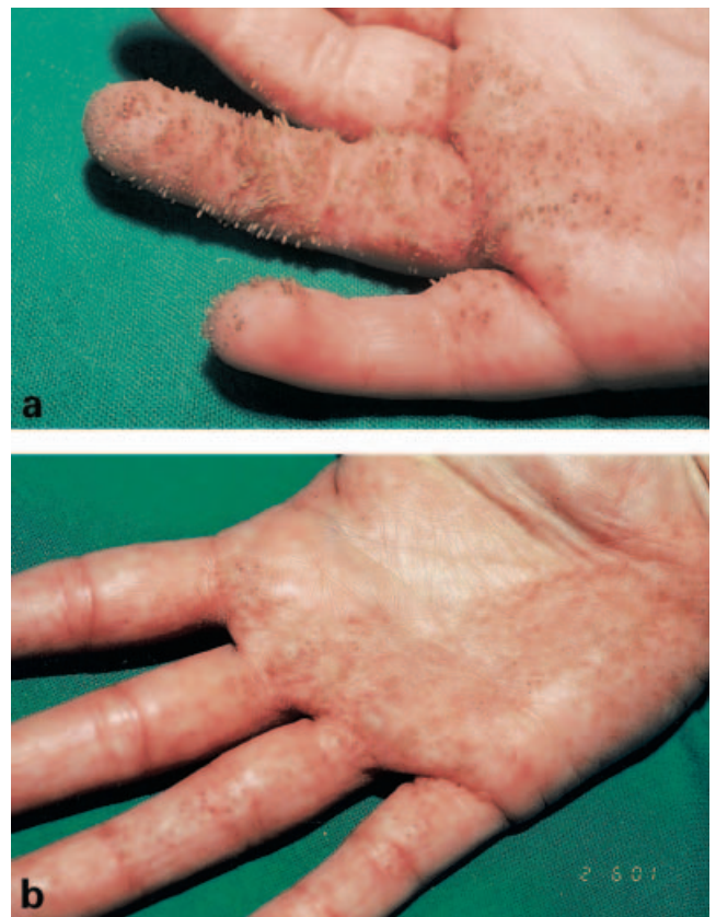
Fig. 1. (a) Numerous verrucous, keratotic papules in linear distribution on the right palm and flexor aspect of the ring and little fingers. (b) Keratotic, comedo-like lesions on the right palm 24 years later.

PEODDN reflects genetic mosaicism and is apparently originated from somatic events occurring during