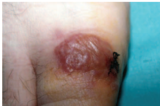
Fig. 1. Sharply demarcated granular plaque on the dorsal area of the right big toe with a vermiculate consistency.

A cutaneous biopsy was obtained. The histopathologic examination of the biopsy revealed a granulomatous dermal infiltrate and scarce stellate abscesses. The granuloma and the margins of the abscesses were composed of lymphocytes, histiocytes, epithelioid cells and multinucleated giant cells. In tissue sections stained with hematoxylin-eosin, numerous rounded, refringent, hyaline or slightly eosinophilic thick-walled fungal structures were present in the granuloma and within the giant cells. Scarce elongated budding yeast-like forms and branched septate hyphae were also present. Fungal elements were strongly stained with periodic acid-Schiff (PAS) (Fig. 2) and Grocott-Gomori methenamine-silver