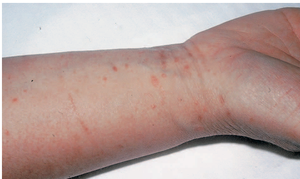
Fig. 1. Multiple erythematous, shiny papules on the volar surface of the right wrist.

A 59-year-old woman suffering from hypertension and hypercholesterolaemia presented with a 4-week history of a bilateral pruritic, papulous eruption on the dorsal aspects of her forearms, hands, on the volar surfaces of her wrists, on the soles and to a lesser extent on her trunk and thighs. Examination revealed multiple lentil-sized, shiny, violaceous papules and larger (up to 1 × 1 cm in size) plaques (Fig. 1). Wickham's striae were seen on the surface of the single papules. She had yellowish-white, lacework forming streaks on the oral mucosa. There was neither other mucosal nor nail or scalp involvement. The patient had begun taking fluvastatin (20 mg/day) for hypercholesterolaemia 4 weeks prior to the eruption. The itching-burning sensations caused by the skin signs were usually most pronounced in the evenings after the drug had been taken. Topical corticosteroids improved the lesions only temporarily. Although the skin and mucosal lesions were characteristic of idiopathic lichen planus, we hypothesized that fluvastatin could be a causative factor. The fluvastatin therapy was stopped and the