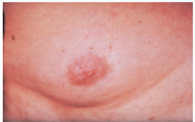
Fig. 1. Areolar sebaceous hyperplasia with the clinical appearance of yellowish thickened papules and plaques.

mentioned 2 years previously. No lesions suspected as being sebaceous hyperplasia were present on his face, while the remainder of his physical examination was within normal limits. In a clinical diagnosis of superficial sebaceous hyperplasia of the areolae, there were no pathological findings in clinical chemistry, including the endocrinological parameters.