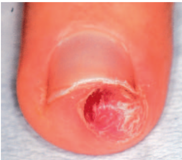
Fig. 1. Red, pea-size nodule.