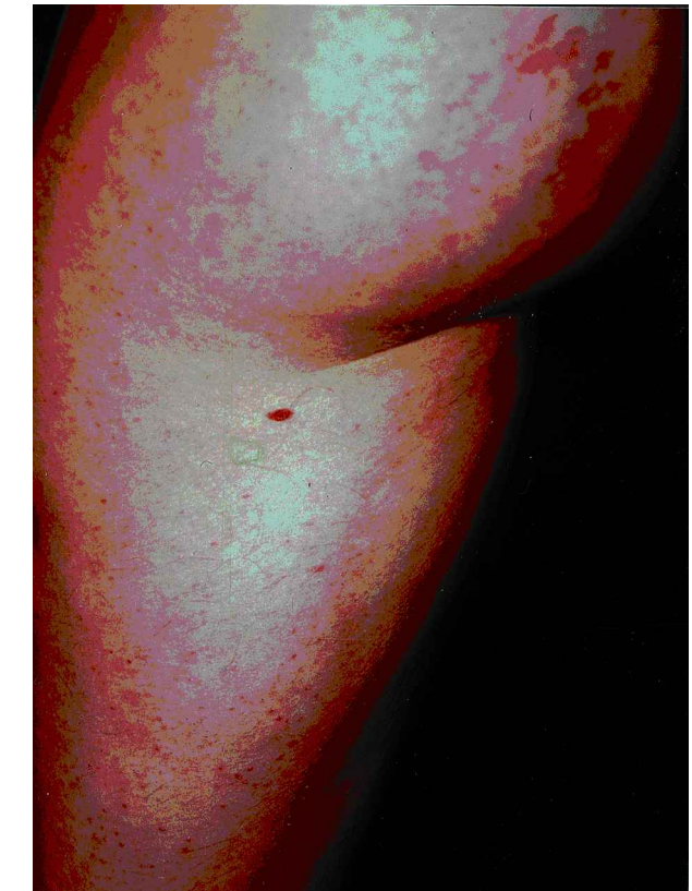
Fig. 1. Linear atrophic telangiectatic lesions on the right buttock and leg. The pattern is consistent with Blaschko's lines.

A skin biopsy taken from the atrophic lesion with telangiectasias on the right leg revealed moderate psoriasiform epidermal hyperplasia with hyaline eosinophilic bodies in the