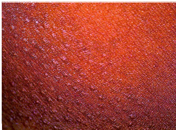
Fig. 1. Follicular papules following the lines of cleavage of the skin.

Disseminate and recurrent infundibulo-folliculitis is a well-characterized entity based on histologic changes