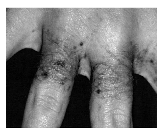
Fig. 1. Bluish-grey discoloration with individual dark blue papules. Conspicuous terminal hairs within the areas of discoloration on the backs of the fingers which are rather fair, in accordance with the patient's complexion.

A skin biopsy of a blue papule from the back of the hand showed a cellular blue naevus extending throughout the mid-dermis into the subcutis. No atypical mitoses or proliferating cells were seen.