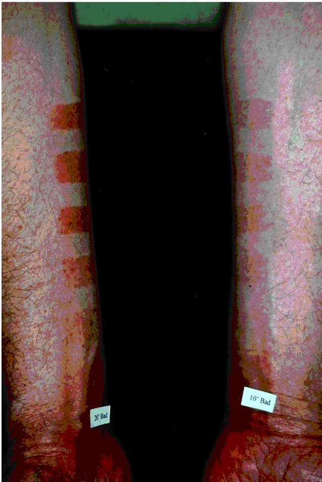
Fig. 1. Minimal phototoxic dose (MPD) of 8-MOP PUVA bath after immersion time of 10 min (left forearm) versus 20 min (right forearm): stronger erythematous response with longer bathing time (patient 8).

(13) was documented for each proband. The ESS is the sum of all single erythema scores for each individual, and is influenced both by the number of visible MPD test sites and the intensity of erythema at each site. Therefore, in contrast to the MPD, the ESS is also able to provide information on the slope of erythematous response. In general, the usage of ESS seems to be superior to plain determination of the MPD in detecting small differences in erythematous responses, as the ESS is a more sensitive evaluation parameter. An inverse relationship is anticipated between the ESS and the MPD.