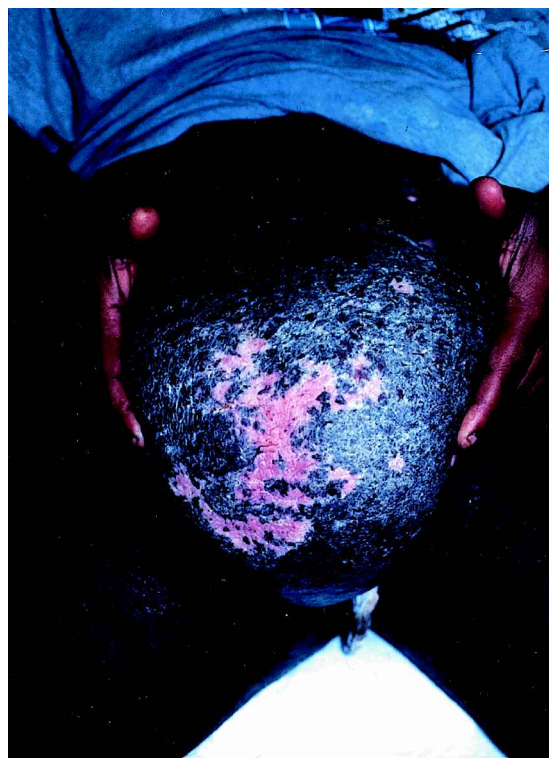
Fig. 1. Lichenified pink-to-violaceous papules and plaques cover the massively enlarged scrotum, which showed no improvement after a course of oral prednisone.

roentgenogram. Results of pulmonary function tests were not available. No abdominal or pelvic lymphadenopathy was detected by computed tomography scan of the abdomen and pelvis. Direct laryngoscopic examination revealed nodular laryngeal and subglottal involvement. The serum angiotensin-converting enzyme level was elevated at 98 U/l (normal range, 20–60 U/l). A complete blood count, liver function panel, blood urea nitrogen, creatinine, and serum calcium and protein levels were all normal.