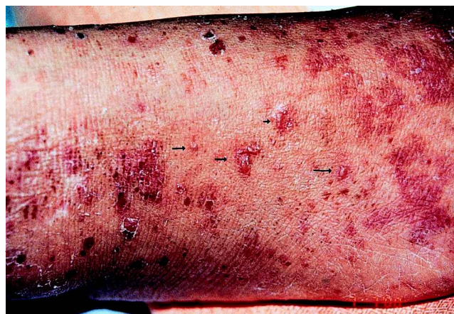
Fig. 1. Vesicles (arrows) and crusts are present on the lower leg.

An 18-year-old female with a 2-year history of hyperthyroidism, which was treated with a 6-month course of propylthiouracil and propranolol, had discontinued the medications for one year until the recurrence of hyperthyroidism presented as tremor, palpitation and heat intolerance. The patient did not have a history of systemic rheumatic disease or any previous complaint of photosensitivity and Raynaud phenomenon. The laboratory studies revealed the anti-thyroglobulin antibody (particle agglutination method, Fujirebio Co., Japan) level 1:25,600 (normal <1:80), anti-microsomal antibody (particle agglutination method) 1:10,240 (normal <1:80), free T4 0.53 ng/dl (normal 0.6–1.6), and TSH 0.27 \mu U/ml (normal <6.5). She was then treated with methimazole 15 mg and propranolol 40 mg daily. A week later, hemoptysis, cough, dyspnea and an itchy skin rash were noted. The skin lesions consisted predominantly of vesicles 1–3 mm in size and crusted erosions on the legs and dorsa of the hands and feet (Fig. 1). The patient was admitted to our hospital where laboratory investigation showed a leukocyte count of 10.1 \times 10^9/l with